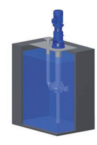
Cantilever application with suction tube