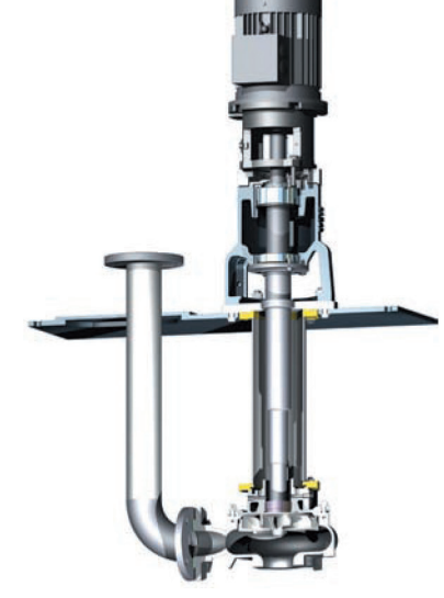
RCC cantilever pumps