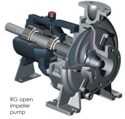
What is your latest product and on what projects are you currently working?

The newborn is the multichannel pump of the RB series, featuring quite high flow rates (2000 m<sup>3</sup>/h) with head up to 70 meters.