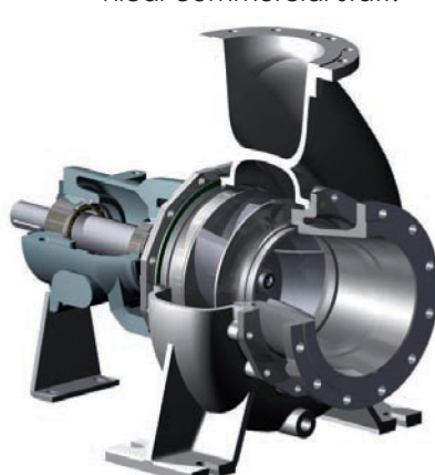
RB series multichannel pump

high viscosity, high concentration of dissolved gases, etc. For what concerns our service we always try to provide prompt answers and offer our full support to our customers in choosing the best machines; we guarantee fast deliveries for pumps and ready spare parts, and we focus greatly on training of the technical-commercial staff.